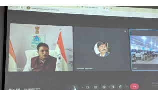
Inspiring UHC Day Talk

Kadhiravan of Periyar University, the workshop offered practical training in innovative therapeutic techniques. With active participation from multiple states, the event focused on integrating hypnotherapy into mental healthcare.